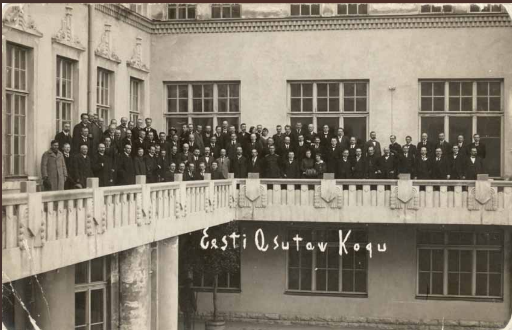
The building of the Estonian National Opera has always been more than just a theatre and a concert hall for the people of Estonia. On 23 April 1919, the first Estonian Parliament – the Estonian Constituent Assembly – assembled in the concert hall of the “Estonia” theatre.