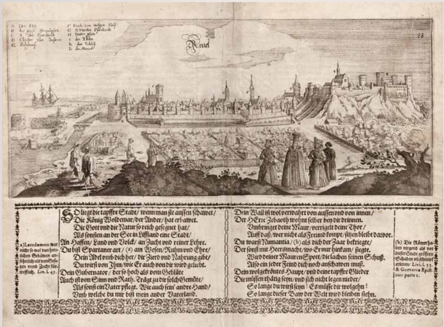
The collection of rarities at the National Library include the oldest views of Tallinn published in print, Adam Olearius' (1603 – 1671) 1647 travelogue Offt beehrte Beschreibung Der Newen Orientalischen Rejse . Below the image is a poem in German dedicated to Tallinn.