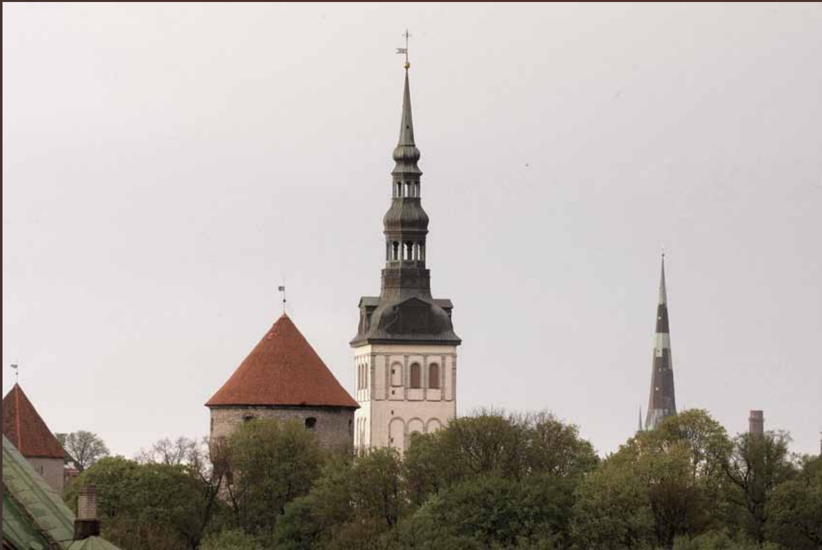
Level 8 of the Library boasts views to the city and the Church of St Charles, which harmonises with the Library.