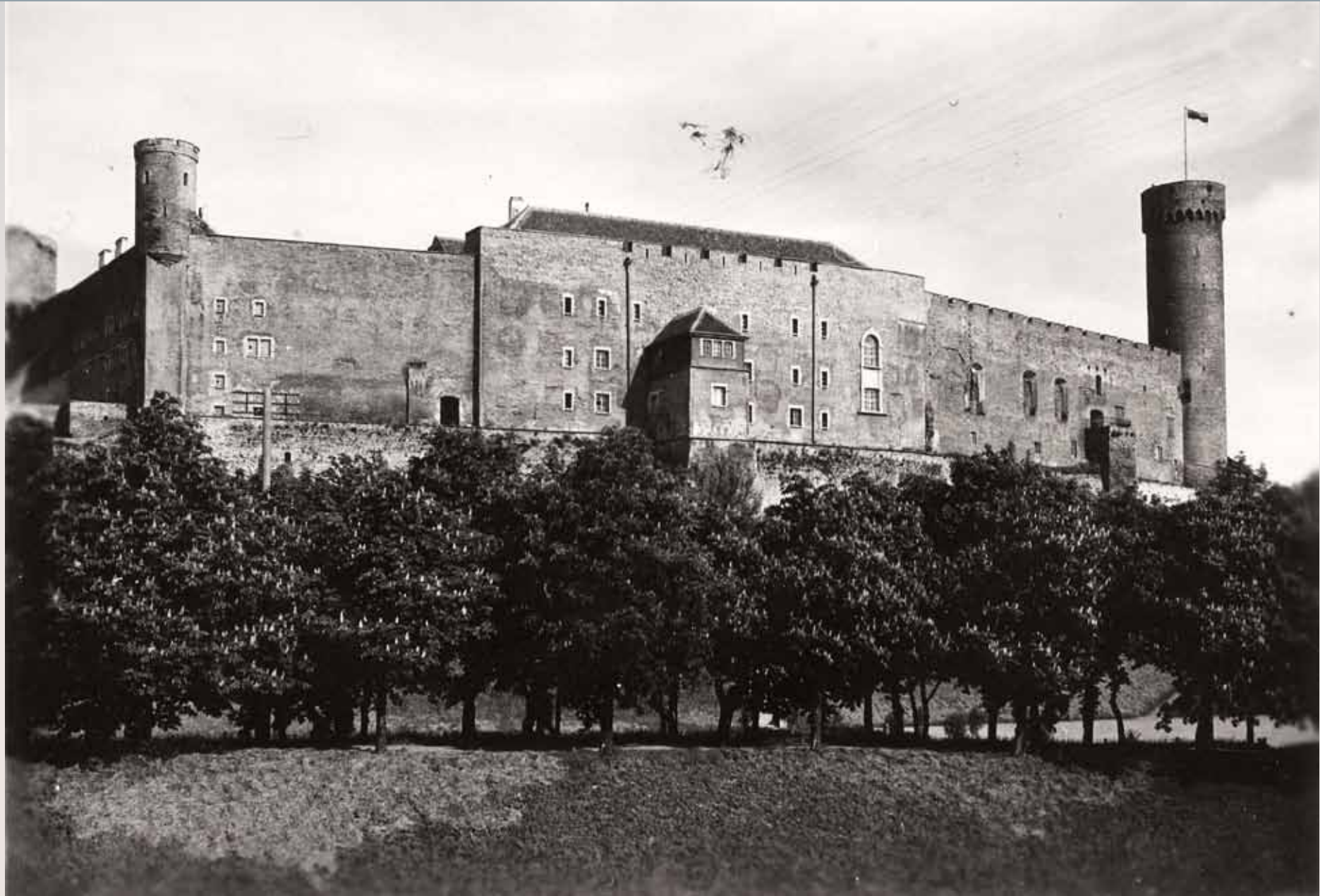
The National Library of Estonia is as old as the Republic of Estonia. Established as the National Library in 1918, the institution was originally housed at Toompea Castle.