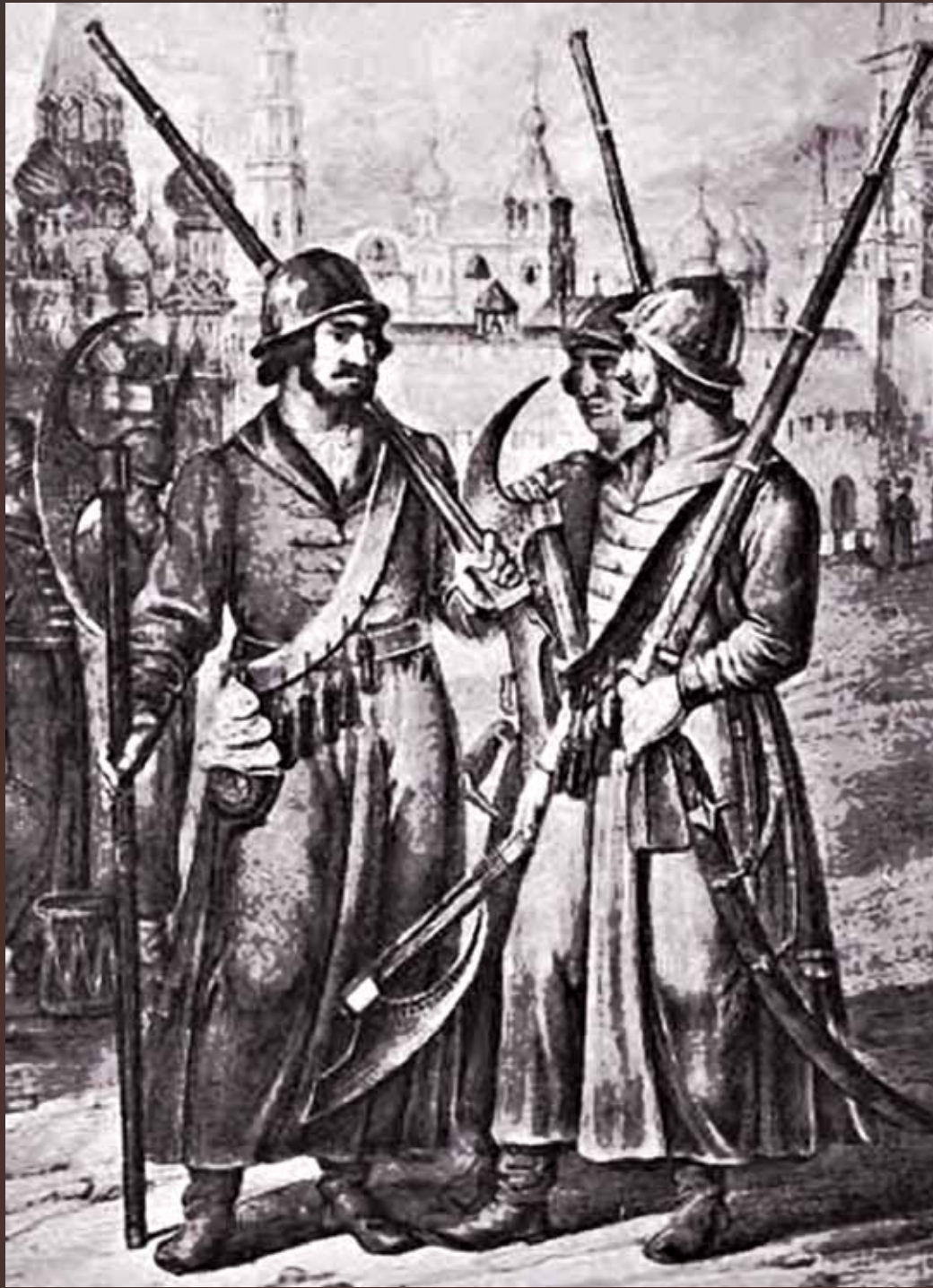
Streltsy in the mid-16th century.