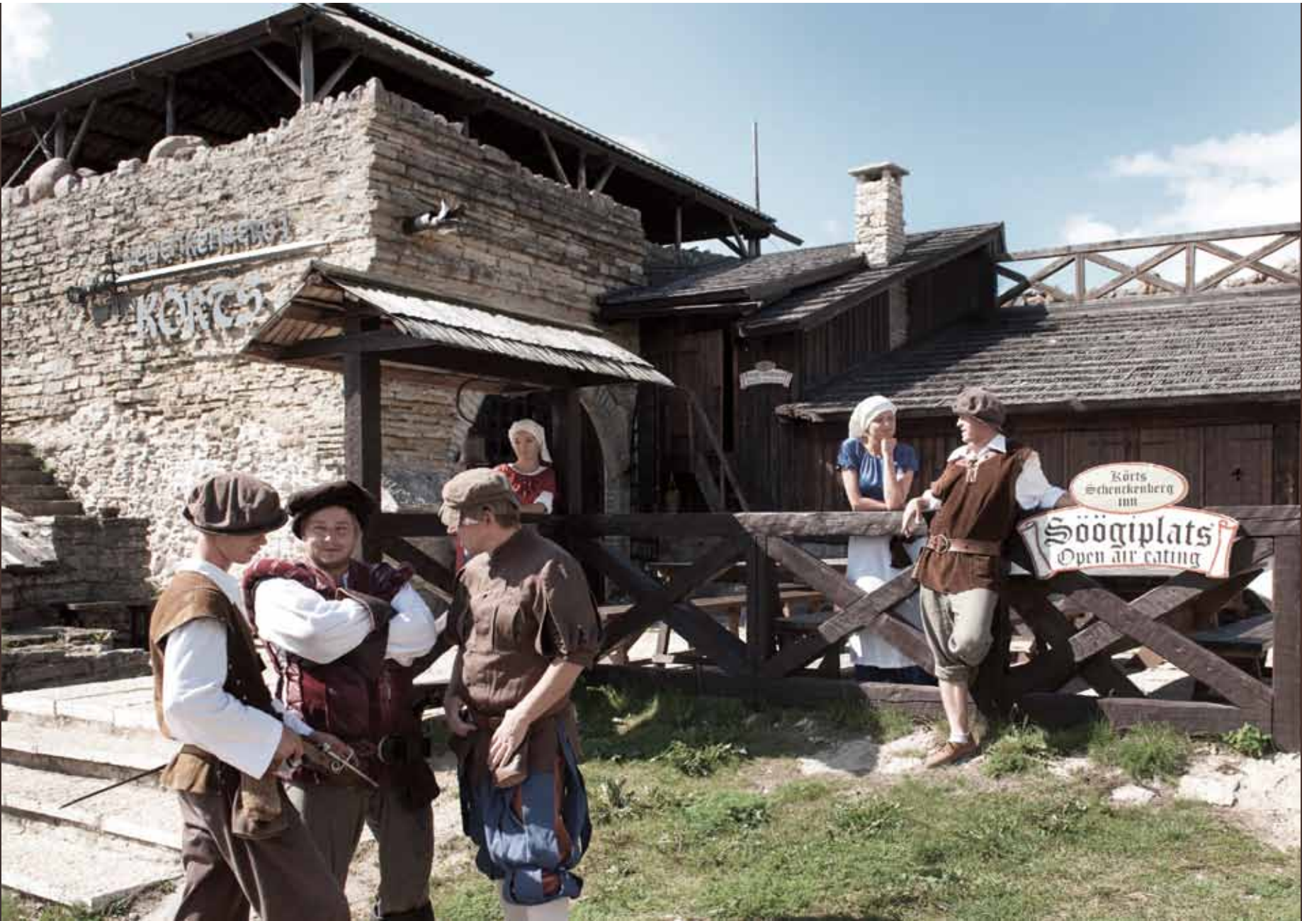
At Rakvere Castle, you can have a horseback ride, practice archery, order mediaeval feasts, or hold corporate summer events, weddings or birthdays.