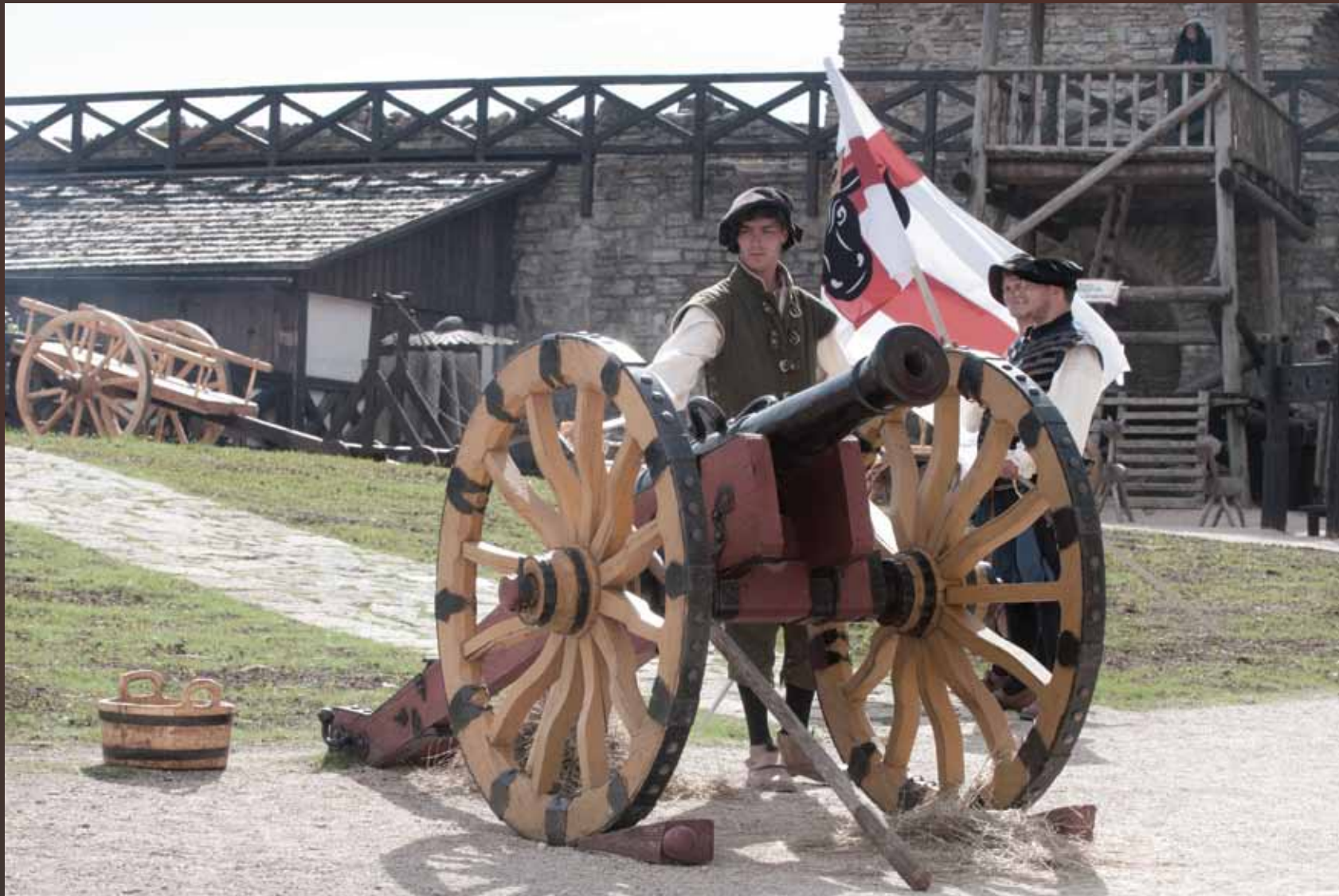
The castle has an excellent permanent exhibition of swords through the centuries, numerous muskets and functioning cannons.