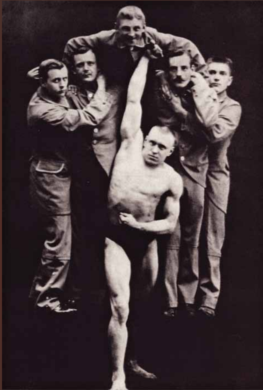
Georg Lurich 1876 - 1920